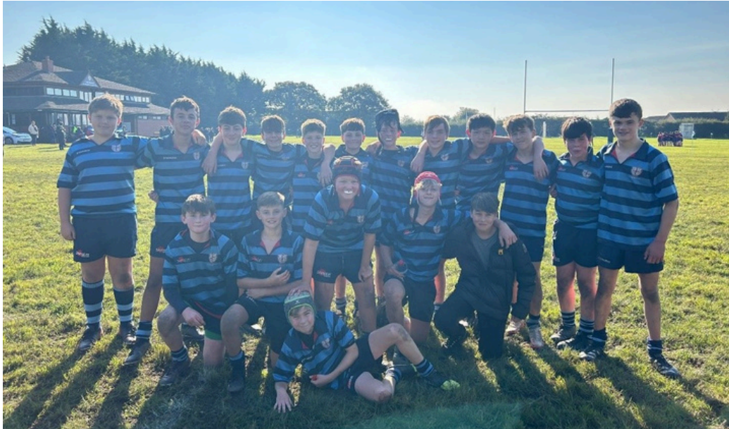
St Anselm's College U13 2024/25 Season