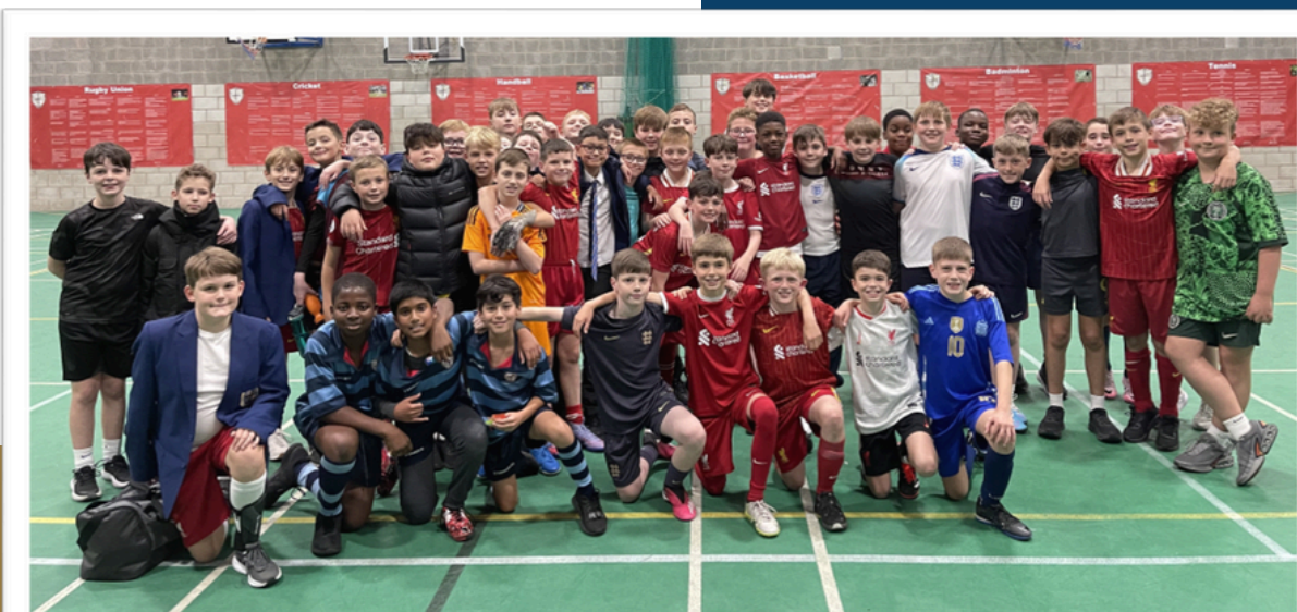
Yr 7 SVP Charity Football Competition