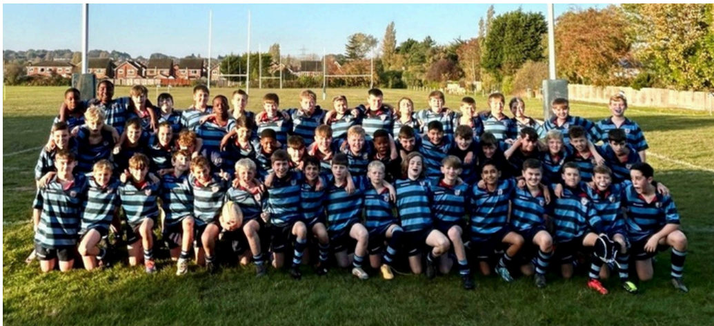
St. Anselm's College U12 2024/25 Season