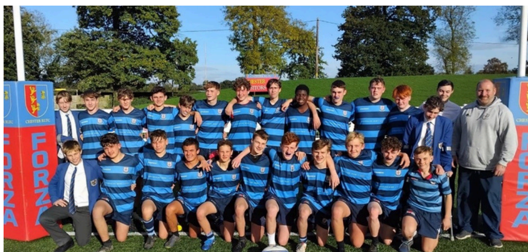
St Anselm's College U15 2024/25 Season