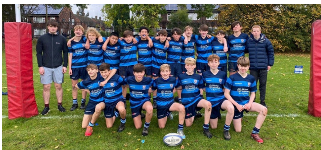
St Anselm's College U14 2024/25 Season