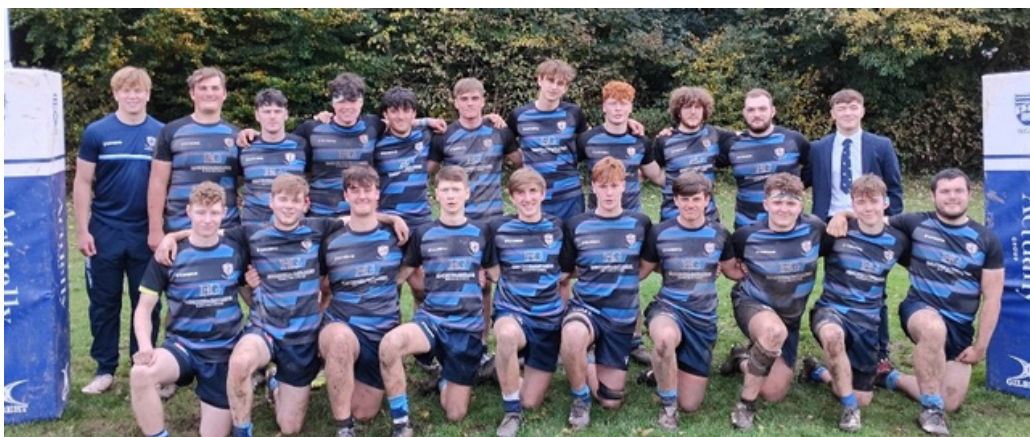
St Anselm's College 1st XV 2024/25 Season

Congratulations to the Success of our Rugby Squad this half term. 'The strength of the team is each individual member. The strength of each member is the team'