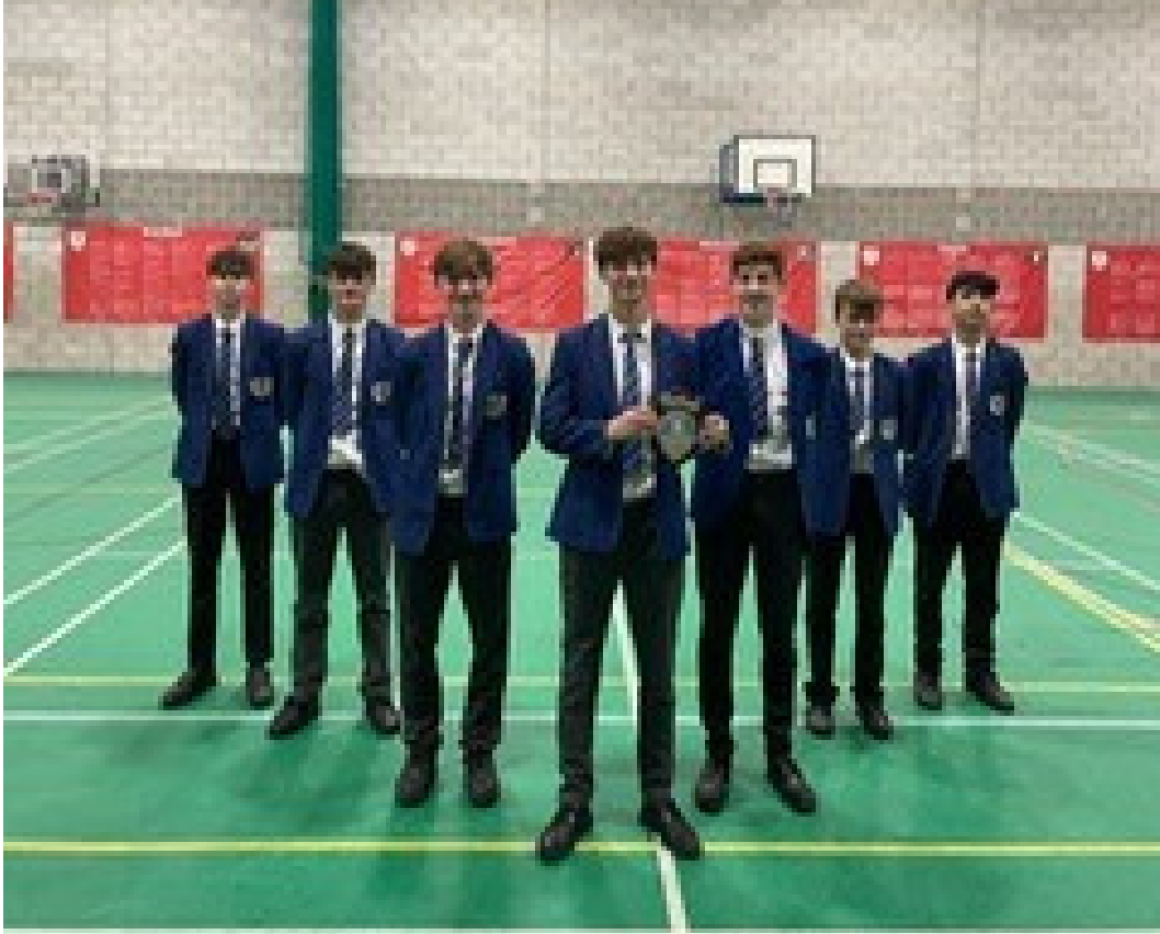
St. Anselm's College U-15 Cross Country Team Wirral Boys' Team of the Year